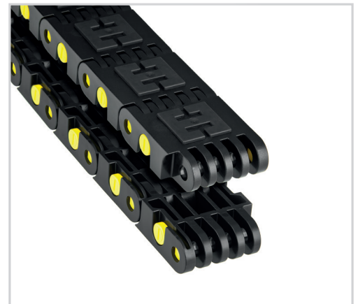
3185 Series RubberTop Chain