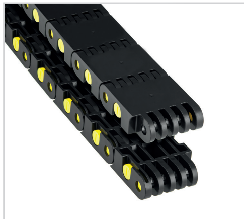
3185 Series SolidTop Chain